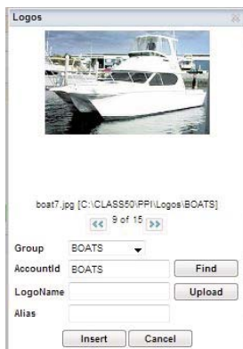
Drag and Drop logos and easy logo selection from database

Class Ad booking shares the Pronto™ text engine with the Classified Pagination program for unprecedented interactivity. Advertising operators can preview lineage ads and semi-displays on screen in an accurate representation with all character attributes